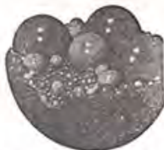
ROLL ON: This theoretical model has ball bearings arranged so that none slips against another.