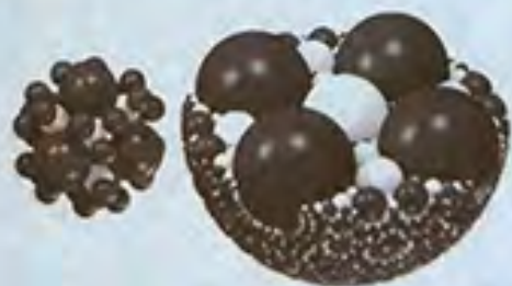
FIG. 1. Bichromatic packing of spheres with octahedral symmetry. No two spheres of the same color touch each other. The image on the left shows the initial configuration and the first generation of inserted spheres.

The inversions are made iteratively with respect to nine inversion spheres [10]: One inversion sphere is concentric with the unit sphere, and is perpendicular to the six initial spheres on the vertices of the octahedron [11]. Inversion